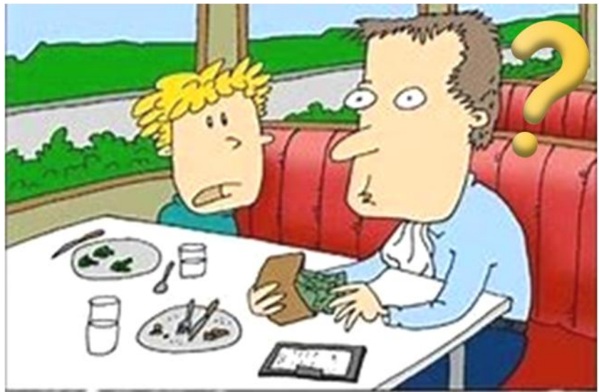
HOW COME THE WAITRESS GETS 15% AND GOD ONLY GETS 10%?